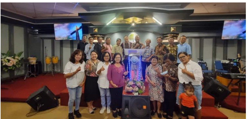
for the next pastor's conference.