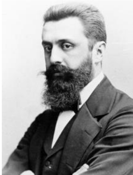
Theodor Herzl (1860-1904)