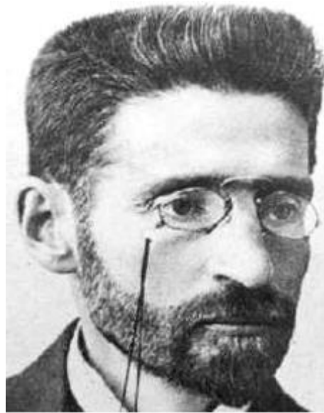
Eliezer Ben-Yehuda (1858-1922)