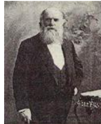
Charles Fox Parham (1873-1929)