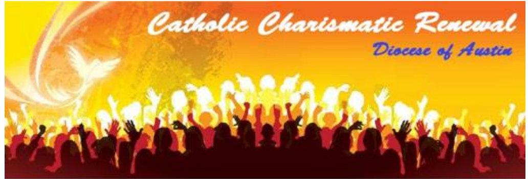
Catholic Charismatic Renewal (1967)