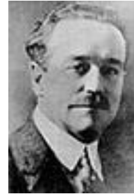
John Alexander Dowie (1847-1907)